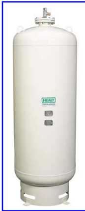
Healy Clean Air Separator (CAS)