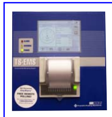
Franklin Fueling Systems INCON