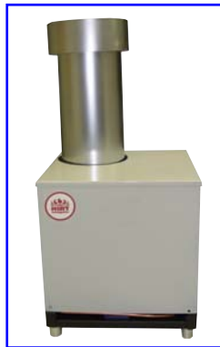
Hirt VCS 100 Oxidizer