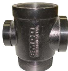
A0079 Extractor Cross Fitting