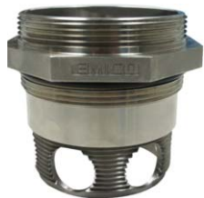
494096 Riser Seal