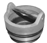
A0279 Extractor Test Plug