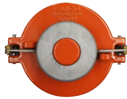
A0099-002 Vapor Adapter Cap