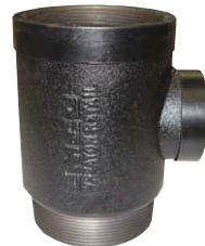
A0079 Extractor Tee Fitting