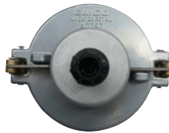
A0097-010 ATG Probe Adapter Cap