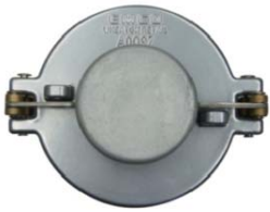
A0097-005 Fill Adapter Cap