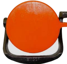
A0099-004LP Low Profile Vapor Adapter Cap