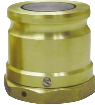
A0076-124S Swivel Vapor Adapter