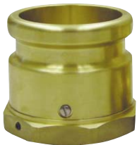
A0030-124S Swivel Fill Adapter