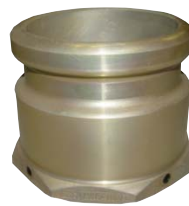
A0030-014 ATG Probe Adapter