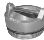
A0179 Extractor Cage