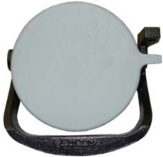
A0097-004LP Low Profile Fill Adapter Cap