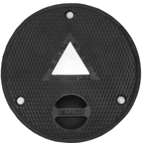
Built-in side handle on 18" models - one hand opening and positioning