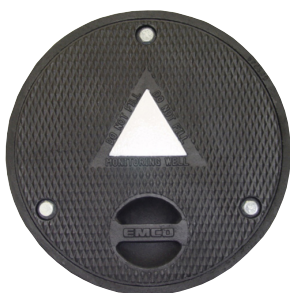
Built-in side handle on 18" models - one hand opening and positioning

■ City of LA Approval BR800075 A0721-001ID, A0721-008CEID A0721-101ID, A0721-108ID