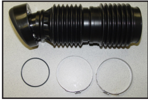
492775EVR Bellows & Boot Face Kit