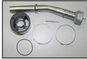
492834EVR Spout Kit