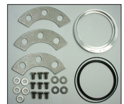
495271 A1005-505 Series Kit