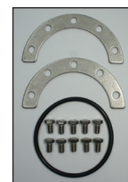
495075 A1005-505C Kit