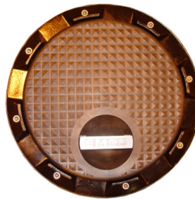
Rim 16"; Lid 13.2"