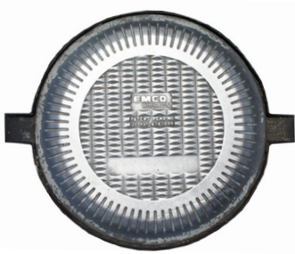
Rim 15.75"; Lid 15.75"