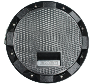
Rim 16"; Lid 13.2"