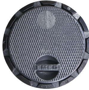
Rim 17.6"; Lid 15.3"