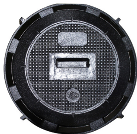
Rim 16"; Lid 12"