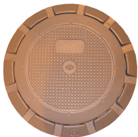
Rim 17.25"; Lid 14" *EBW 702 is slip-on