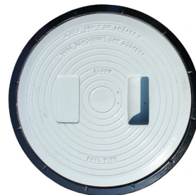
Rim 16"; Lid 14"