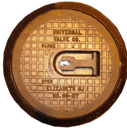
69RT, 71CD Rim 15"; Lid 12.75"