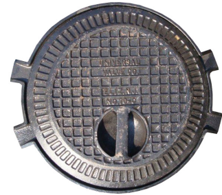
70C; 71CD Rim 15.75"; Lid 15"