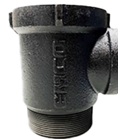
3" Outlet Threads