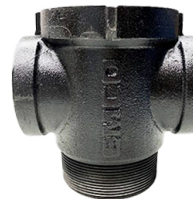
3" x 3" Outlet Threads