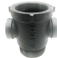
2" x 2" Outlet Threads