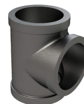
4" Outlet Threads