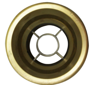
Installed in A0030-124S Swivel Fill Adapter