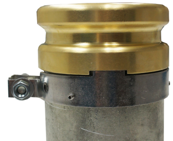
Installed on pipe nipple with A0030-024A Adapter

The Emco Wheaton A0032-001 Adapter Clamp installs on the riser pipe or pipe nipple. The A0032 is used with the following non-swivel adapters: A0089, A0096, A0030-024A, A0030-024BA and A0076-005. The tabs are aligned with the notches on the adapter, and the three set screws are tightened to prevent the adapter from loosening in use, in compliance with EPA 40 CFR Part 63 requirements.