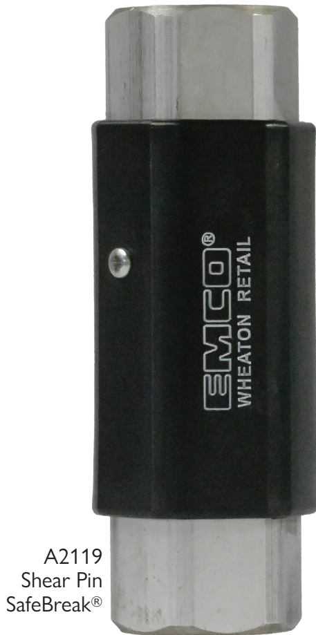
A2119 Shear Pin SafeBreak®