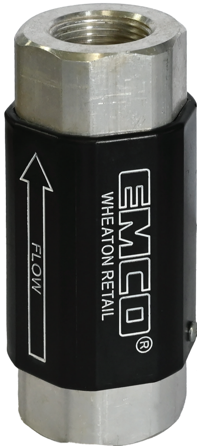
A2219 Reconnectable SafeBreak®