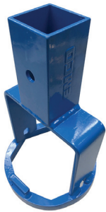
A0081-001B Adapter Wrench Bit