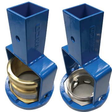
A0081-001HB Spill Containment Wrench Bit