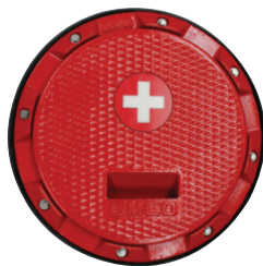
Lid and rim available powder coated to API color specifications

Special assembly tool facilitates 1-hour installation