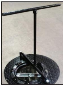
A0081-001R Lid Wrench

Special assembly tool facilitates 1-hour installation