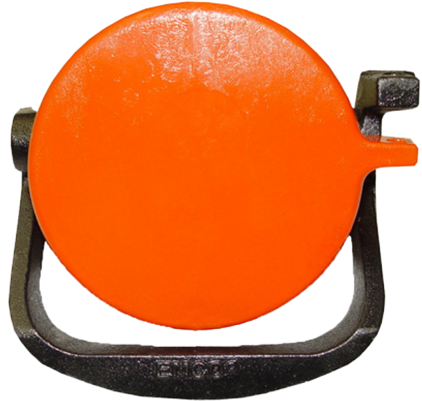
A0099-004LP Low Profile Vapor Cap

Low profile cap designed for use when there is limited space between the top of the adapter and the spill containment lid. The fill cap is powdercoated gray and the vapor cap is powdercoated orange for identification purposes. The caps fit all Emco and major competitor 4" cam and groove style adapters.