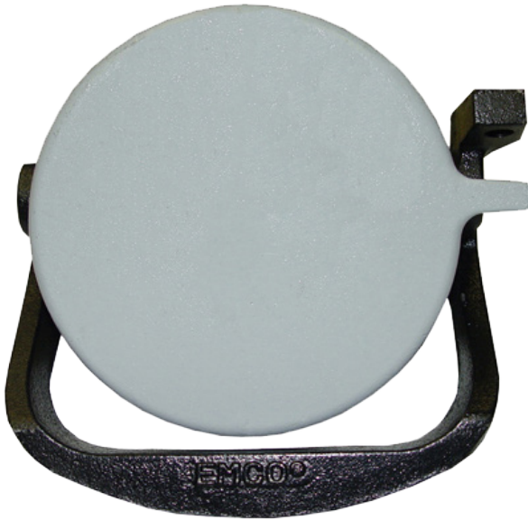
A0097-004LP Low Profile Fill Cap