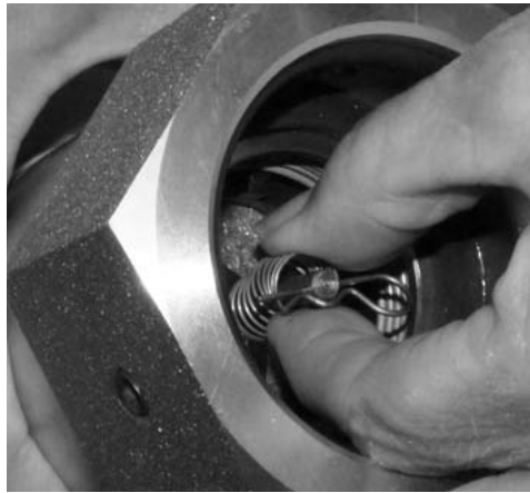
Then pull up on the spring.