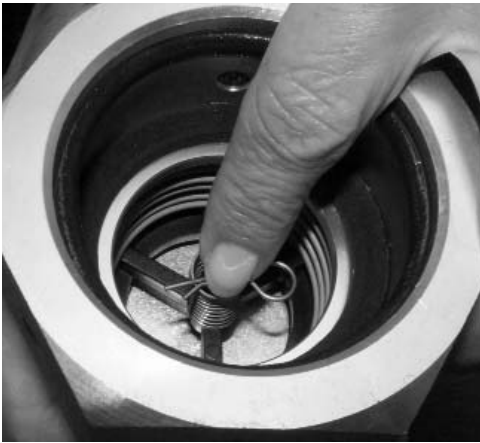
Push down on the brass stem.